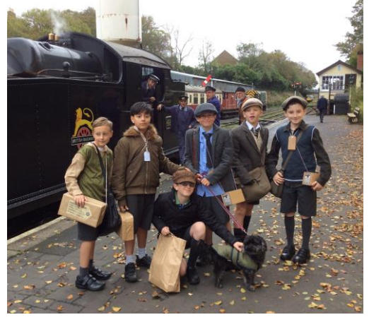
Thank you so much to all the Y6 parents for making a voluntary contribution which enabled this trip to go ahead. Your support is much appreciated and the children had an amazing day.