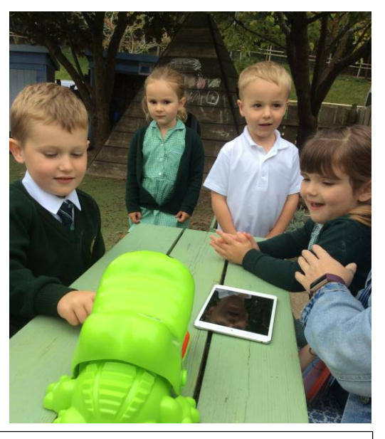
What could be more exciting and scary than touching the teeth in a crocodile's mouth!!! Will his jaws snap shut?! Phew – we all finished the day with our fingers intact. ©