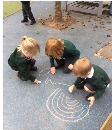
The children in reception class love dressing up and using the chalks in the playground. They are an amazing class. ©